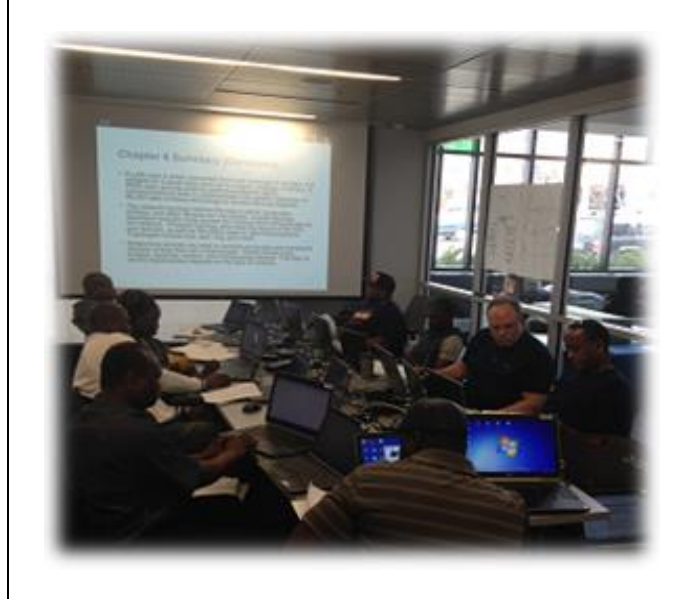
Mobile Site 3: 315 University Ave. W., Saint Paul Mobile Site 4: Lifetrack, Saint Paul